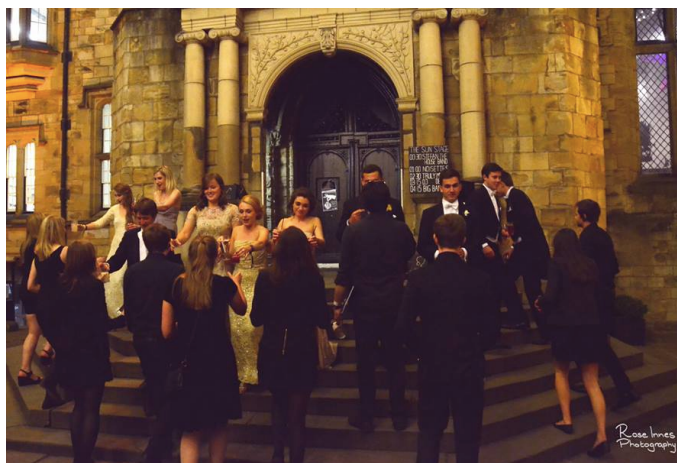
JCR Exec handover at June Ball 2014.